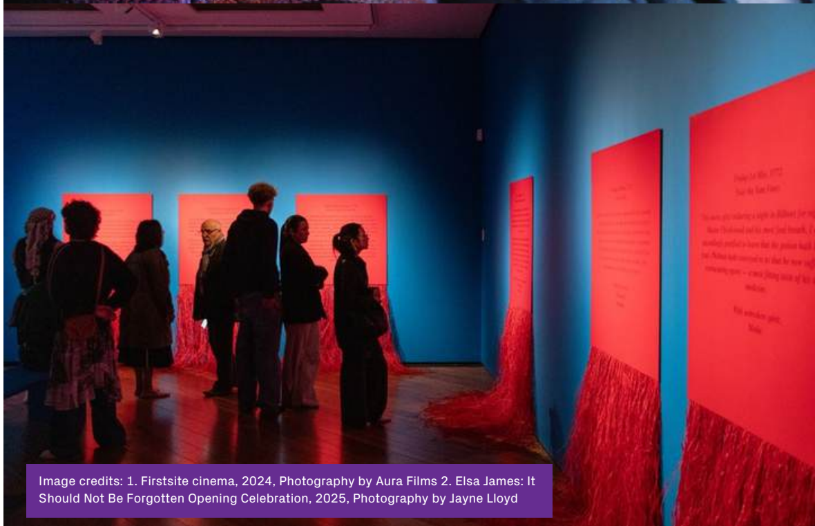
Image credits: 1. Firstsite cinema, 2024, Photography by Aura Films 2. Elsa James: It Should Not Be Forgotten Opening Celebration, 2025, Photography by Jayne Lloyd