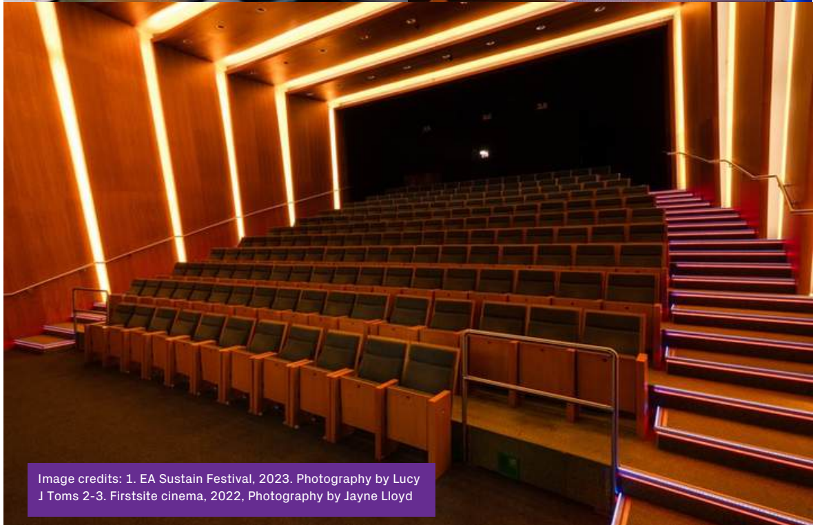
Image credits: 1. EA Sustain Festival, 2023. Photography by Lucy J Toms 2-3. Firstsite cinema, 2022. Photography by Jayne Lloyd